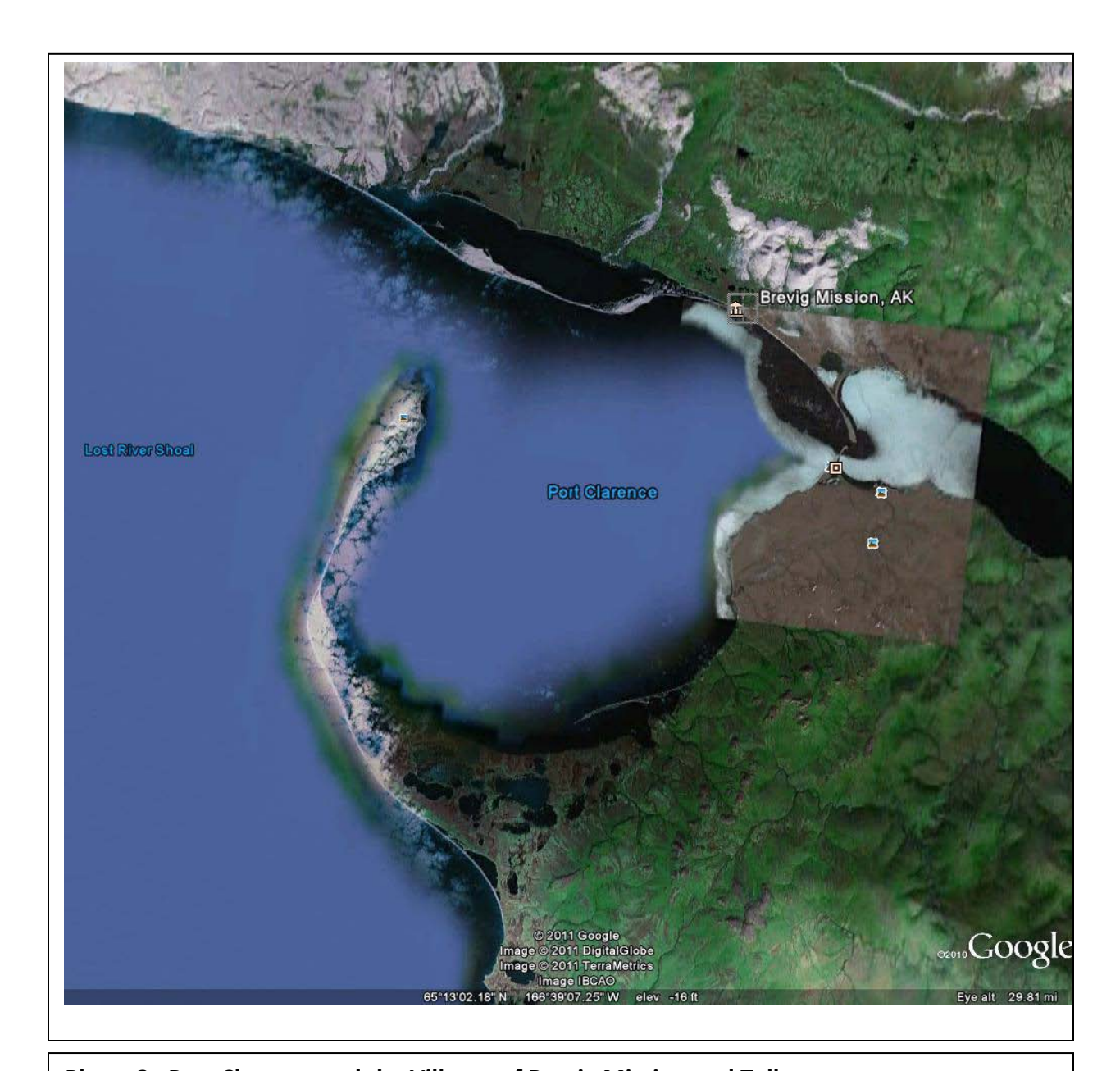
Photo 2. Port Clarence and the Villages of Brevig Mission and Teller.

Port Clarence, and the villages of Teller and Brevig Mission. A protected harbor with access from the Bering Sea. The village of Teller is located just below the passage into Grantley Harbor. Port Clarence has a depth of around 6 to 7 fathoms which should be able to accommodate a 12.5 meter (42 feet) draft vessel. A rail freight terminal at Port Clarence would allow ships to load cargo and expedite transit through the Arctic routes during the main shipping season, April to October.