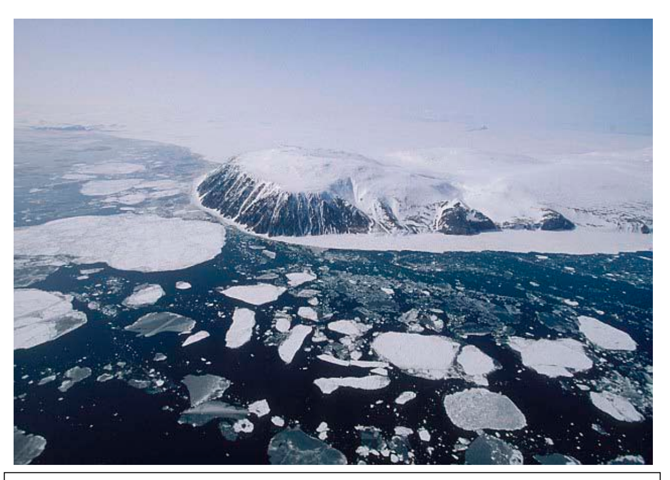
<u>Photo #3: Diomede Island in the Bering Sea. The proposed Bering Strait Rail Tunnel will pass through both Little Diomede (United States) and Big Diomede (Russia).</u>

Trip of a lifetime: The Kremlin has given the green light for a £60-billion tunnel linking Siberia to Alaska through the Bering Strait.