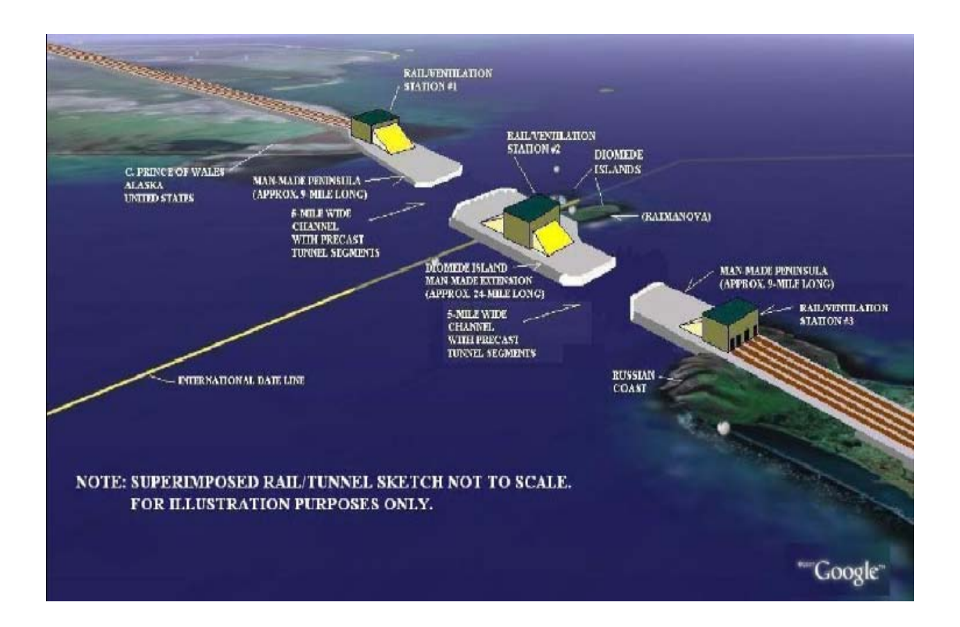
Illustration 1. Superimposed Railroad Tunnel Sketch (Not To Scale)

Conceptual schematic of the proposed Quadrail tunnel under the Bering Strait from Siberia to Alaska. The 64-mile tunnel would run from Cape Prince Wales on the Seward Peninsula in Alaska (top left) under the Bering Strait to Cape Deshnev on the Chukotka Peninsula in Russia. This tunnel would be twice as long as the 34-mile English Channel Tunnel.