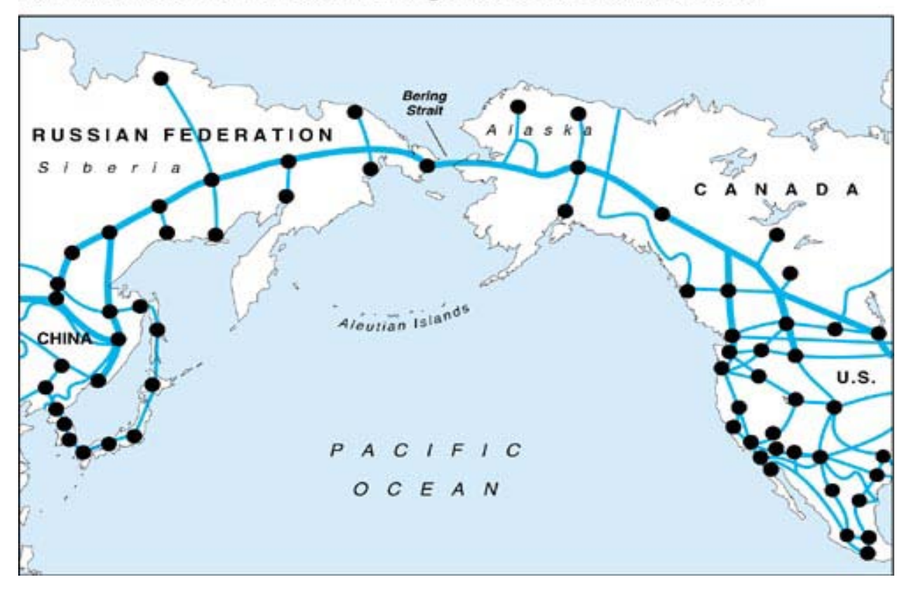
Illustration 2. Plan For A Tunnel Connection Under The Bering Strait Between Siberia And Alaska.

A graphic illustration of the expansive network of potential economic impact of the Bering Strait Tunnel. This illustration only covers the west coast of Canada, America, and Mexico and the east coast of Russian Siberia and eastern China and Japan.