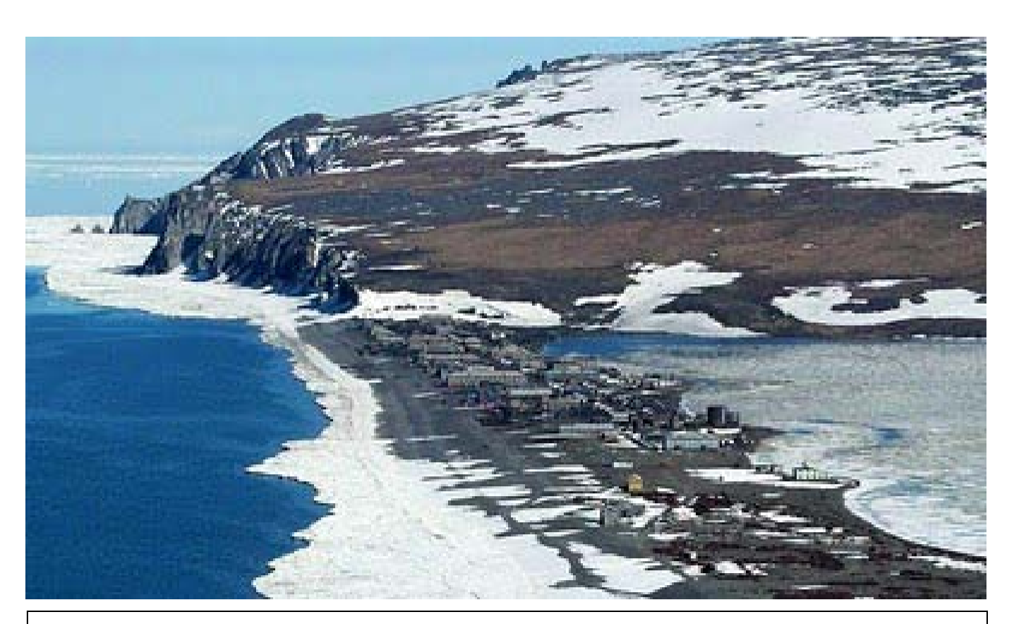
Photo #4: Located where the Bering Sea meets the Chukchi sea, Uelen is the easternmost settlement in Russia and all Eurasia. Uelen also is also the closest Russian settlement to the U.S.