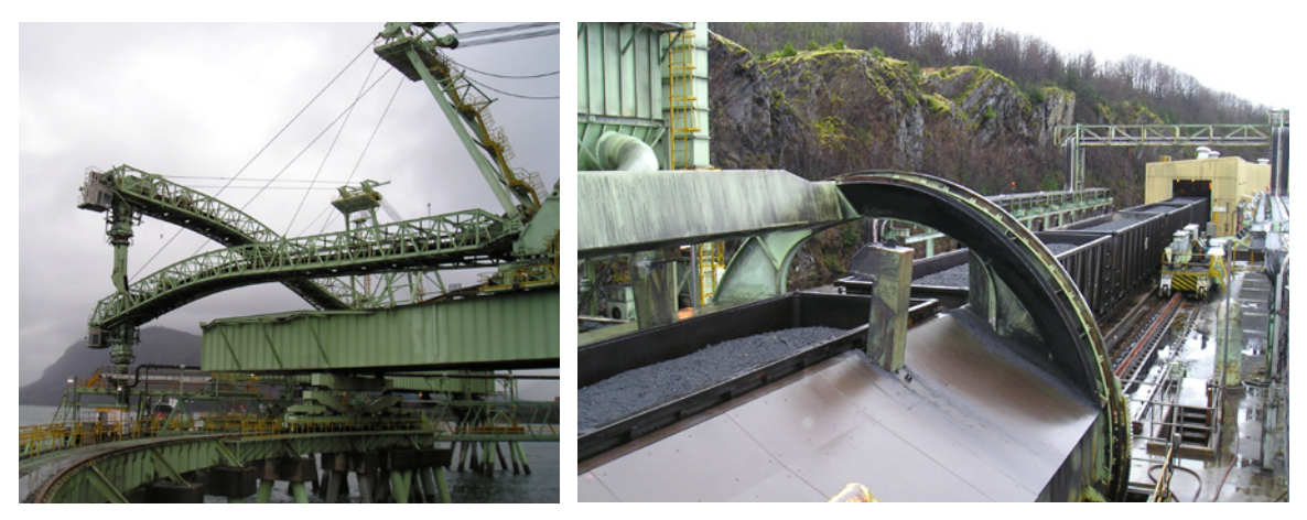
Continuous rotary rail car dumper and coal transfer at Prince Rupert