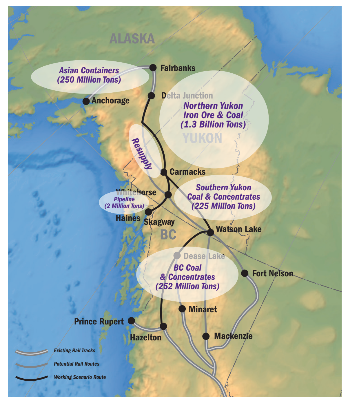
Fifty year life-cycle sourcing for traffic geographically oriented to route options connecting the Alaska Railroad at Delta Junction to Skagway/Haines in Southeast Alaska and to the Canadian National Railway in Northern B.C.