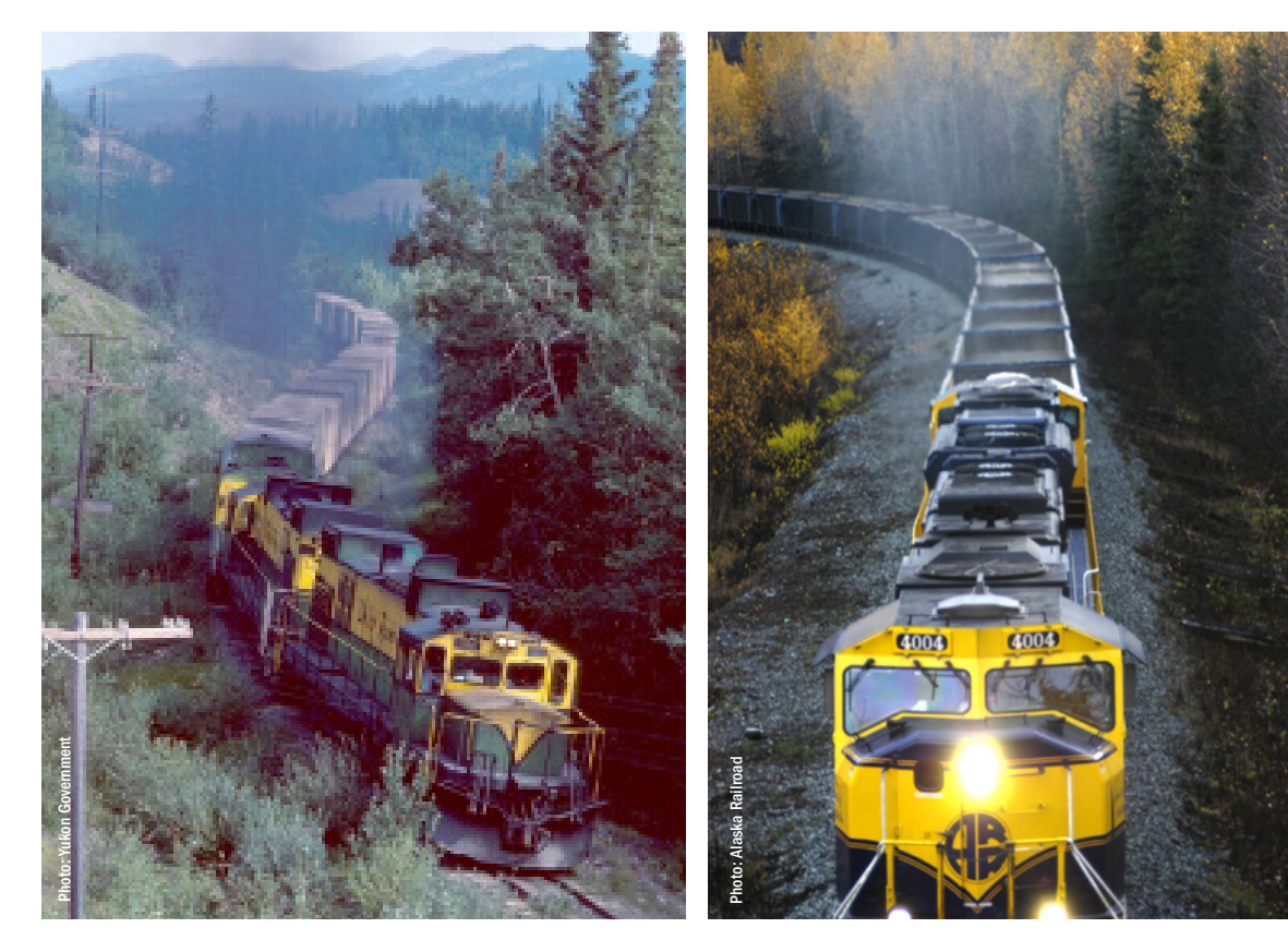
White Pass & Yukon Route Yukon Container Train

The Alaska Canada Rail Link Project · Phase 1 Feasibility Study · Summary and Conclusions