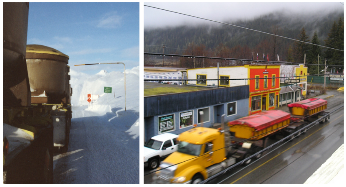
Concentrate truck hauls to Skagway and Stewart/Hyder